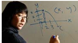
Los Angeles teacher ratings